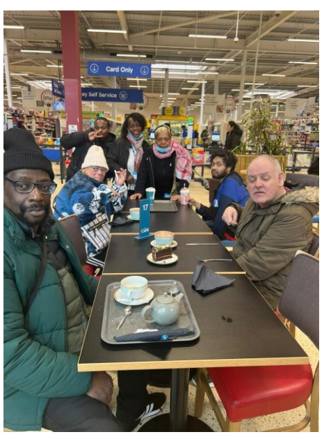
The Firs took the coffee morning in the road recently and ended up in Tesco!

Theresa from Wychall Rd enjoying the sunshine out and about